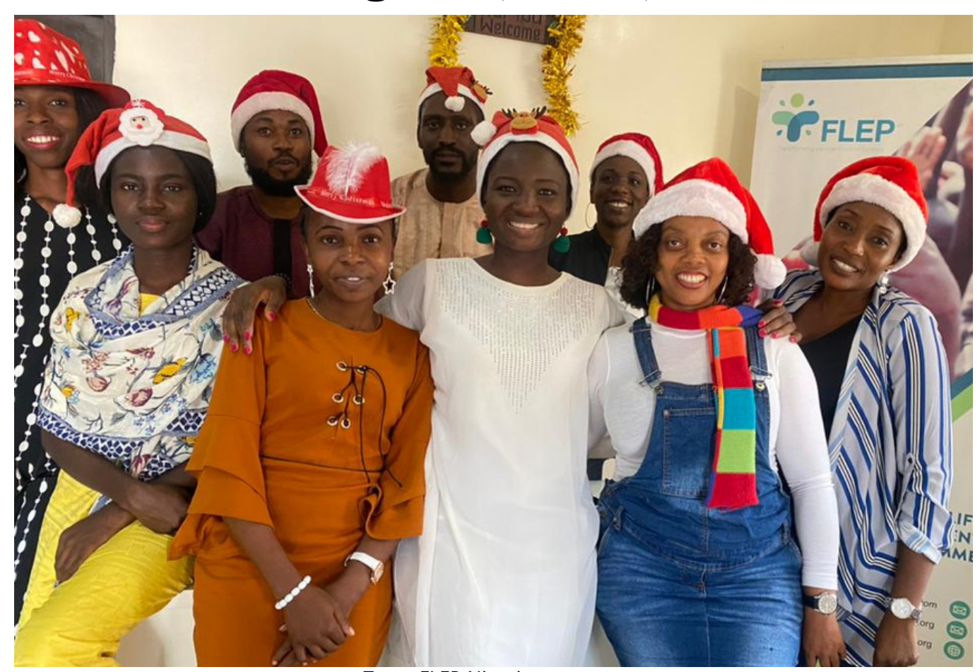
Team FLEP Nigeria