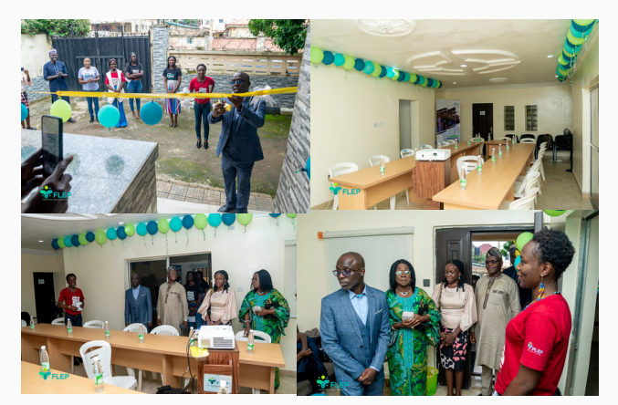
We had our Office opening & Fundraising in August 2023