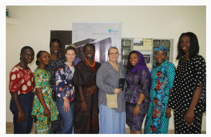
We received the Sweden Mission Council (SMC) at FLEP's office November 2023